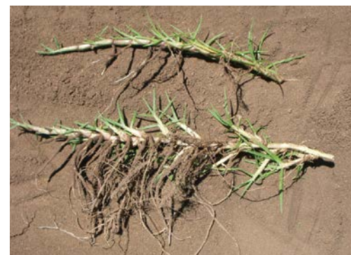
Village Green premium kikuyu (bottom) versus common kikuyu (top) stolons