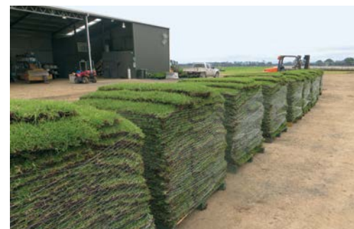
Village Green premium kikuyu slabs

Stolons: Sod is shredded, broadcast and then incorporated into the soil. Installation is easy and inexpensive but requires time and inputs to grow in. Suited to low cost sites where time is not critical. Only suited for establishment between October – February.