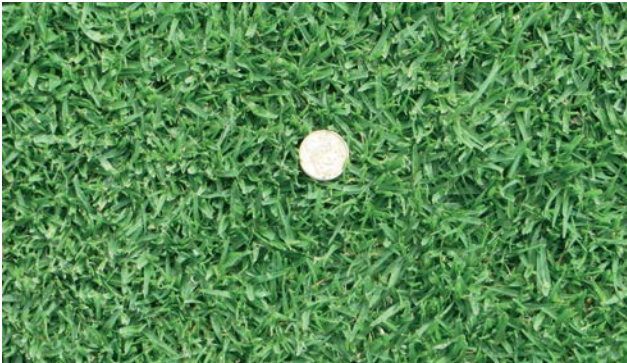
Village Green premium kikuyu low mown