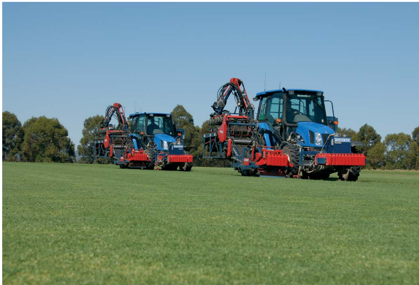
Harvesting Village Green premium kikuyu

For a list of local suppliers please go to www.villagegreenturf.com.au