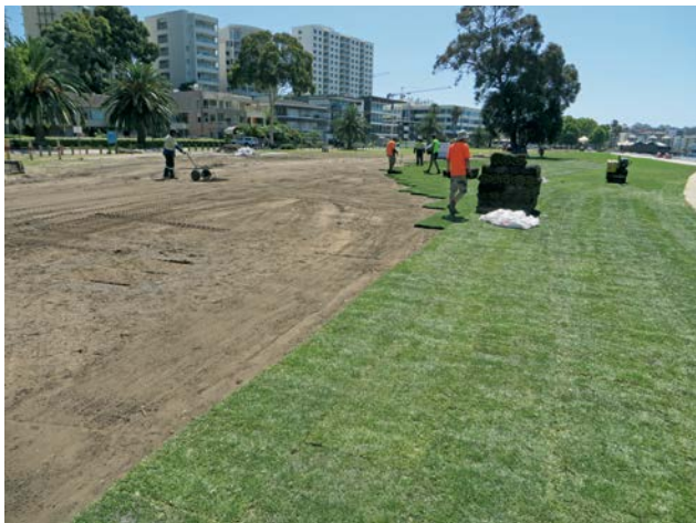
Laying Village Green premium kikuyu standard rolls