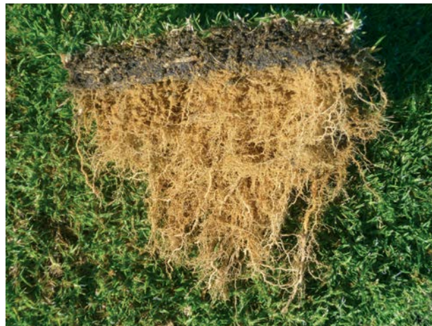
Village Green premium kikuyu's massive root system