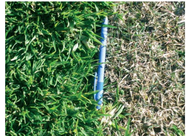
Village Green premium kikuyu (left) versus couch (right) in winter