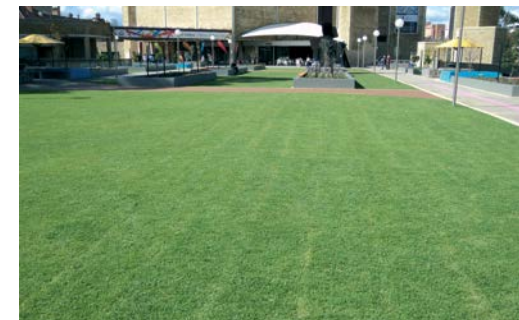
Well laid job