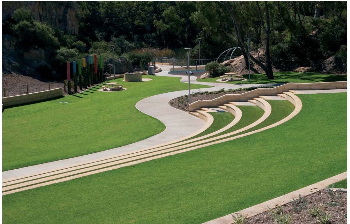
Meadow Springs Mandurah