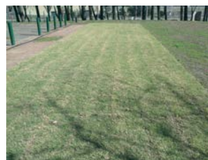
Three weeks later

Village Green premium kikuyu tested at Exhibition Park Canberra during July. Three weeks later after subzero temperatures it still has a green cover and well established roots.