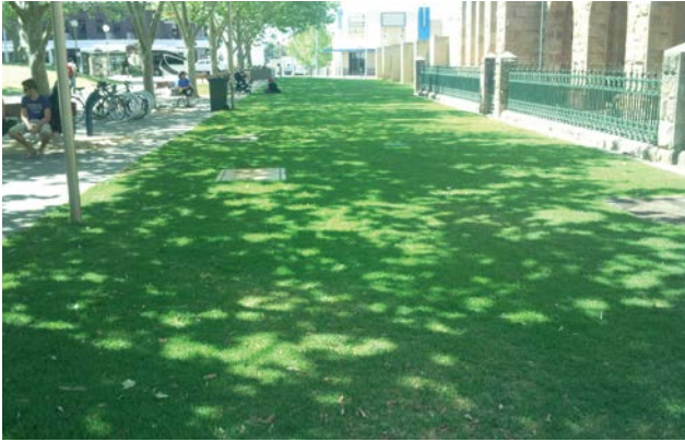
Village Green premium kikuyu tolerates dappled light