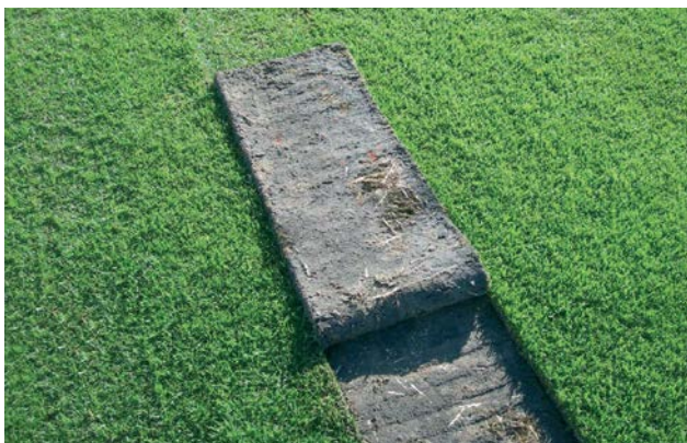
Quality Village Green premium kikuyu